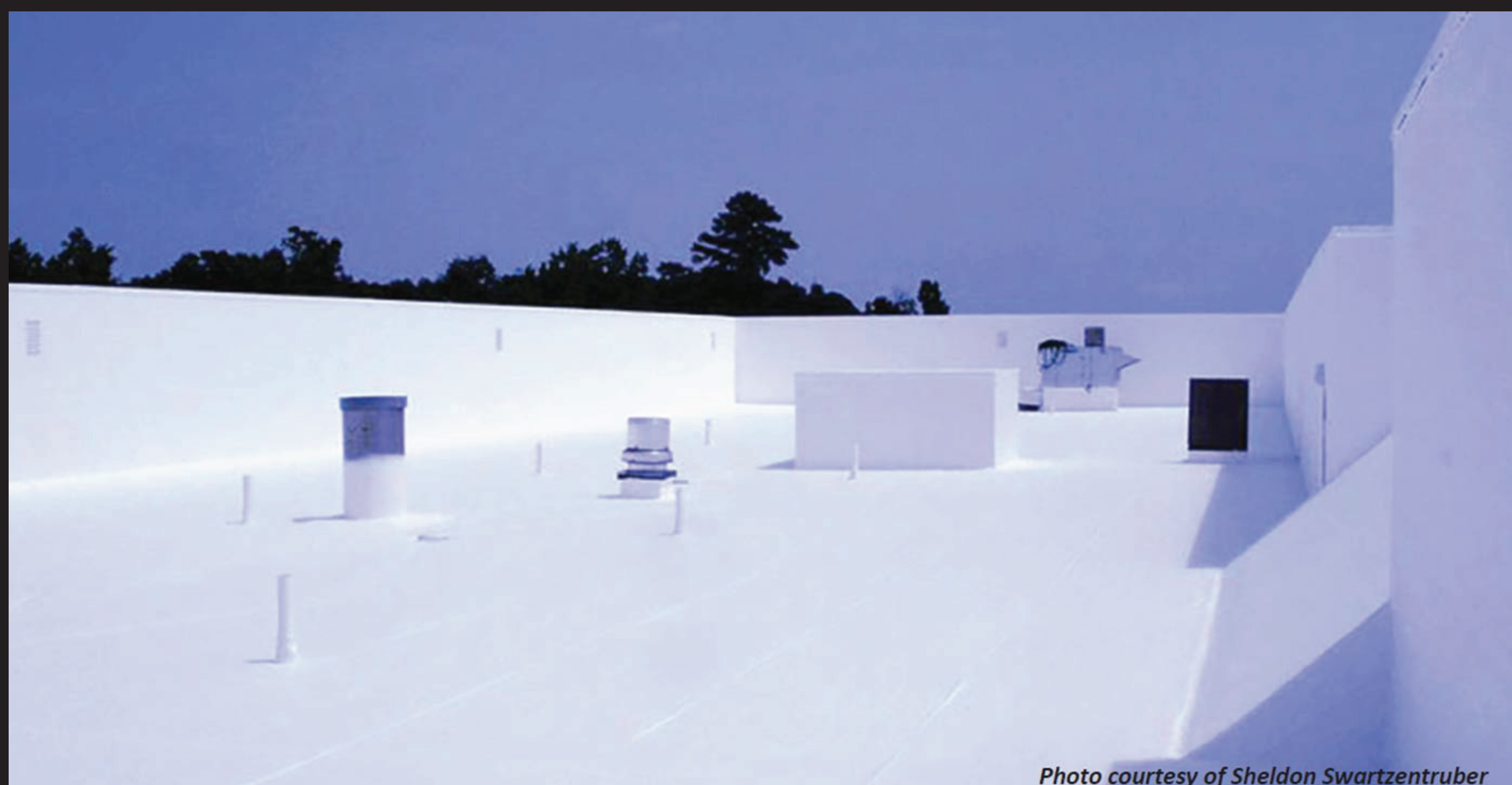
An Example of Single-Ply Membrane (TPO)